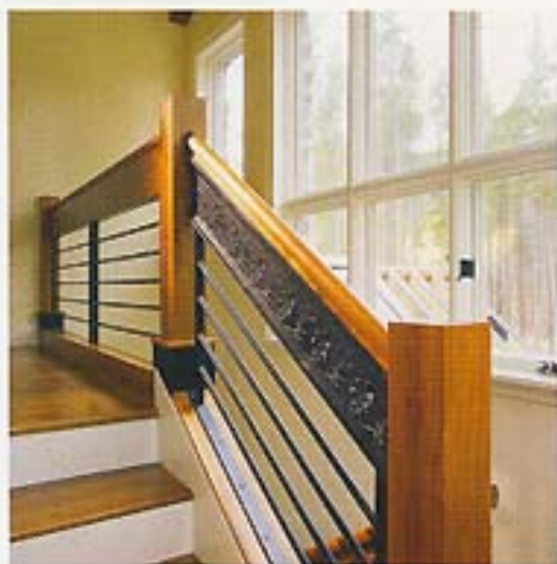
Details up close: Pictured from top, a custom stair rail matched to an antique iron grill found at a flea market; a mixture of tumbled travertine and glass tiles in the master bath; and a whimsical stone blend in the hallway.

Architect Lawrence + Gomez Architects Builder Boxwell Construction Landscape Gary Rooster