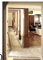
Radiant heat – Pole Creek House floor s throughout, 2000