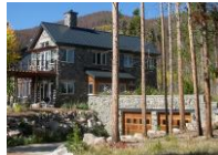
Green roof – garage at Pole Creek, 1999