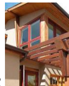
Natural solar controls – exterior trellis shades of Bluff House, 2002