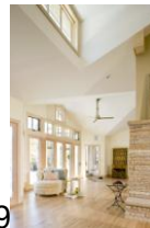
Daylighting – clerestory windows at Rustic Trail House, 2009