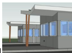
Superinsulated – Gatehouse 2011