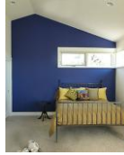
Reduce – small footprint of Bluff House, 2005