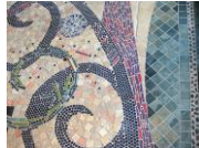
Recycle – Clubhouse mosaic floor, 2003